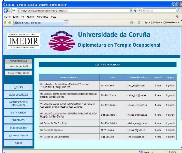
Fig. 8. Practice with tutors discharged into the system

This feature is that after embracing the students, establishing revolving spreading among all these groups tutors practices available (Fig. 8). The system provides avoid situations like the coincidence of two or more rotating for the same group during the same dates, or to prevent a group of students attending a practice more than once.