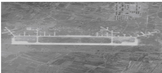
Fig. 2 Original Airport Image

Fig.2 is a breadth 400 \times 556 grey level airport original image which the length and the width ratio reduce to 50% of the image; Fig.3 is the airport characteristics after MF algorithm detection, identification and extracted.