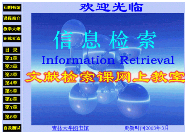
Figure 2 Main interface of IRLSO

for both the initial use for teaching and learning IR course online, and further system development. This actually realised the primary tasks of the purposive and utility classes for this IR system.