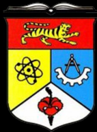
University Kebangsaan Malaysia