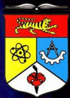
University Kebangsaan Malaysia