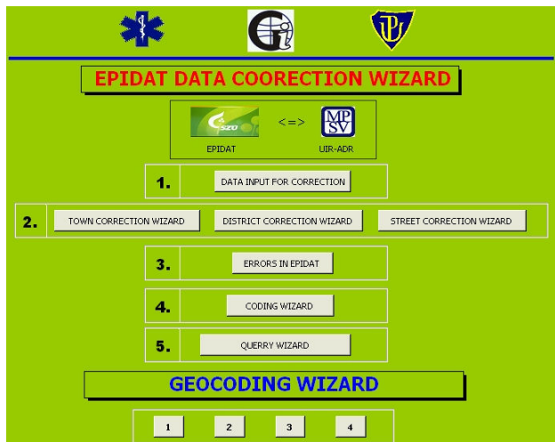
Fig.5 Interface of EPIDAT data correction wizard

The simple wizard was designed for correction and navigation in the steps of the EPIDAT database correction (Fig.5). All database processing and interface of wizard were made in the database system Microsoft Access 2003. The correct database structure and correct setting of cardinality of relation were made according conceptual model. Conceptual database model is the important stage in database design process [11].