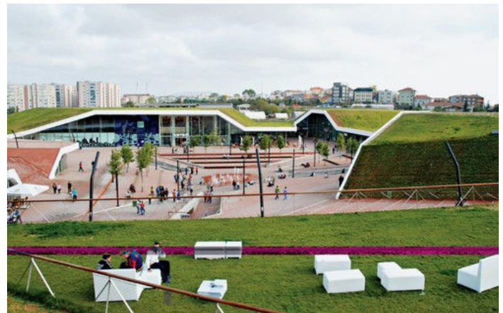
Fig. 5: A view from a shopping center exterior circulation areas.

When polished, concrete becomes highly reflective. This system works with floor heating underneath. High thermal mass absorbs and releases heat energy gradually, helping to regulate internal temperatures naturally [6] Fig. 5.