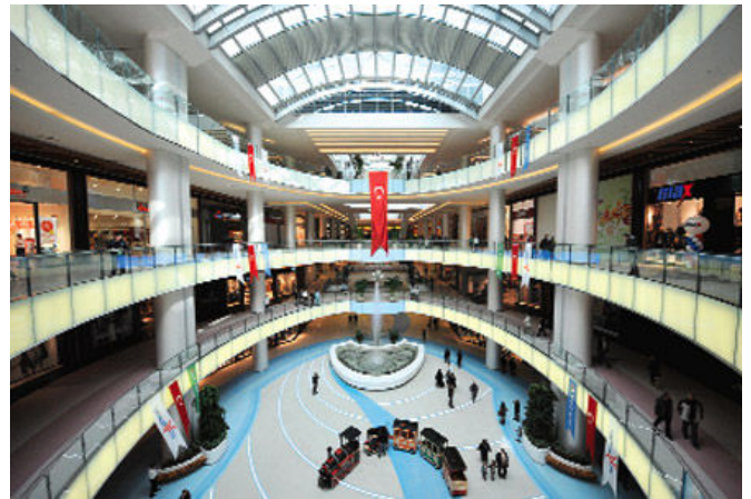
Fig. 4: A view from a shopping center interior, in circulation areas.

Stone floors, including slate, lime stone, flagstone, granite and marble are durable and full of character. But these materials are non renewable, extremely heavy and stone quarrying can degrade the landscape extensively [6], Fig. 4.