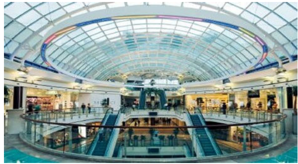
Fig. 2: A view from a shopping center interior, in circulation areas.

Daylight factor investigations cannot help to develop glare prevention strategies for different facade orientations, even though problems of glare associated with low solar altitudes are known to be most prominent for east and west facing facades and which can be significant. Daylight factor analysis cannot even provide a warning flag as to whether there will be a glare problem in certain parts of a building [6] Fig. 2.