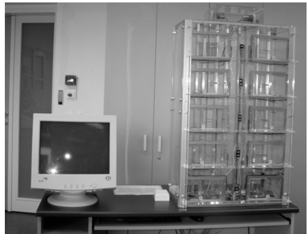
Fig. 4 A photo of workplace with an elevator model

Whole workplace consists from these parts: