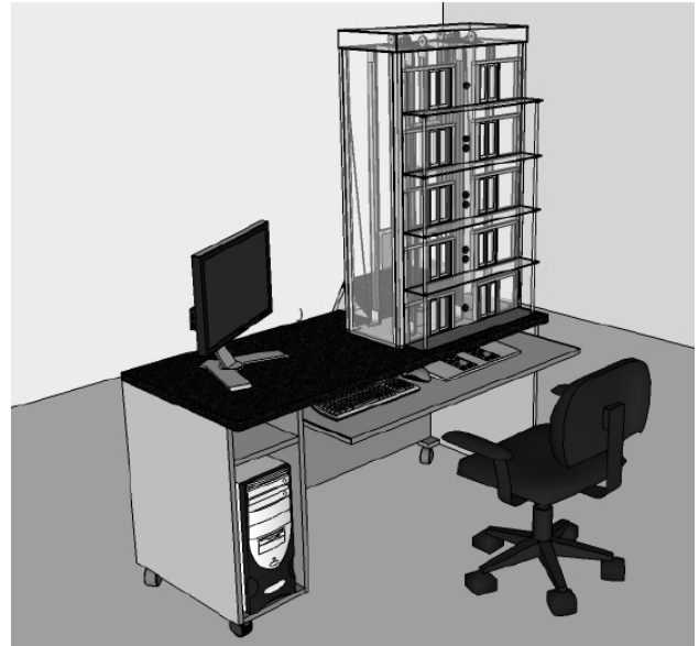
Fig. 3 Workplace with an elevator model

The newest model in our laboratory is an elevator model with 2 cabs and 5 floors (Fig. 3).