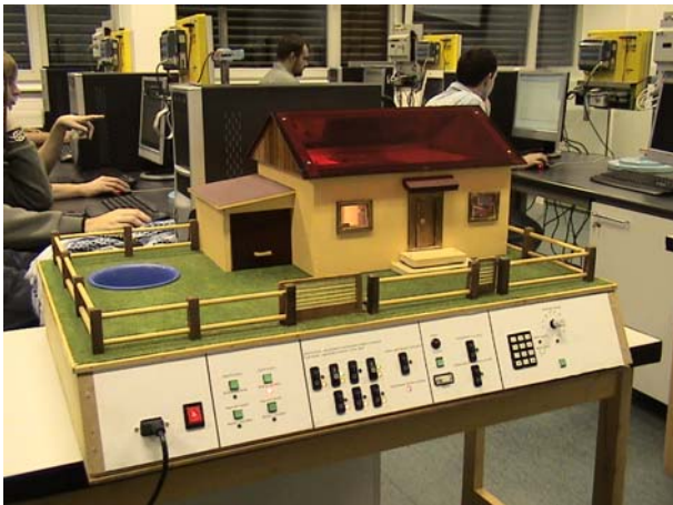
Fig. 2 A family house model