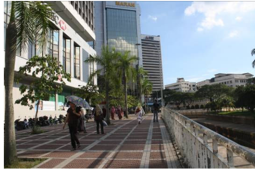
Figure 14: Shadows that created under high rise building along the waterfront provide shade that give comfort to the public.

In order to provide user friendly and pleasant linkage, the waterfront should bring the sense of comfort that be able to experience by the users. Shadows that created under high rise building along the waterfront provide shade that give comfort to the public (See figure 14). Series of landscapes at some part of the pedestrian walkway break down the stress in the city by providing more greenery elements. Series of wide pedestrian walkway shows that the waterfront is concerning pedestrian comfort.