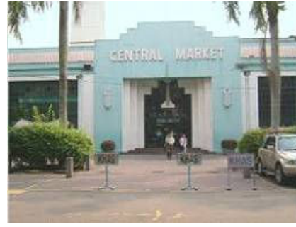
Figure 6: Latest image of the art and cultural market.