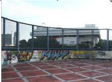
Figure 12: The Graffiti drawings at the end of the walkway

The pedestrian walkway along the river is directing people to the Central Market and an open stage at the edge of the river (See figure 13). The stage created cultural and recreation activities which variety to the site. The crowd can enjoy a variety of presentations and demonstrations such as drawing batik with traditional methods and aerobic dance.