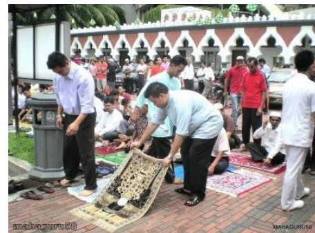
Figure 10: Common view during Friday prayer.

Masjid Jamek will always visit by the crowd as it is a place with variety of activities. It is not only a place for praying, but can be a place for education, meeting, the place that holding a festive ceremony in connection with the religion of Islam and other. This mosque will be over flooded with the crowd up to the street during Friday prayer (See figure 10).