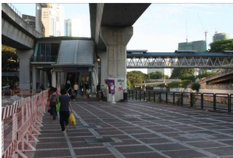
Figure 8: The public pathway direct the user to LRT station provide easy access for pedestrian.

The mosque is easily to reach by public using Star LRT (station Masjid Jamek) and nearby on walking distance is the Central Market, China Town, Little India and the Merdeka Square. While Central Market can be accessed by many modes of transportation such as Putra LRT and get off at the Pasar Seni station, or hail a cab and travel a direct route to Central Market (See figure 8). This accessibility encourages people movement and provides easy access to space for public.