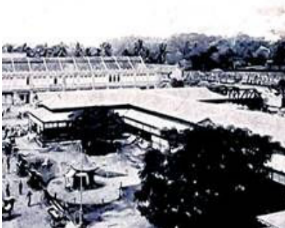
Figure 5: View of the Central Market during early 1900s formerly functioned as a wet market.

Central Market or Pasar Seni is one of the places of interest in the city of Kuala Lumpur. The old market square had been transformed to be functioned as cultural and art centre (See figure 5 & 6). There are 300 shops that sell handicraft products and cultural activities that reflect the image of this multiracial country.