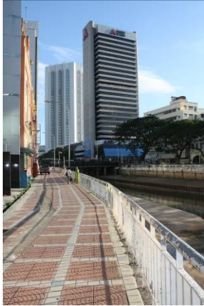
Figure 7: Long pedestrian walkway along the waterfront linkage that lined with high density commercial buildings.

The mosque is easily to reach by public using Star LRT (station Masjid Jamek) and nearby on walking distance is the Central Market, China Town, Little India and the Merdeka Square. While Central Market can be accessed by many modes of transportation such as Putra LRT and get off at the Pasar Seni station, or hail a cab and travel a direct route to Central Market (See figure 8). This accessibility encourages people movement and provides easy access to space for public.