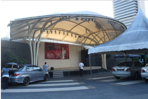
Figure 13: Open stage attract the public for cultural and recreation activities.

The pedestrian walkway along the river is directing people to the Central Market and an open stage at the edge of the river (See figure 13). The stage created cultural and recreation activities which variety to the site. The crowd can enjoy a variety of presentations and demonstrations such as drawing batik with traditional methods and aerobic dance.