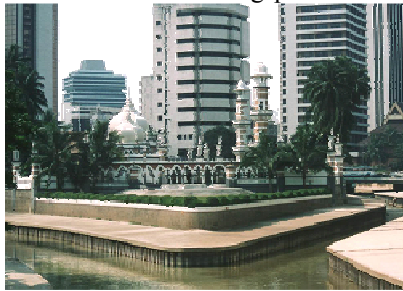
Figure 4: Masjid Jamek nowadays