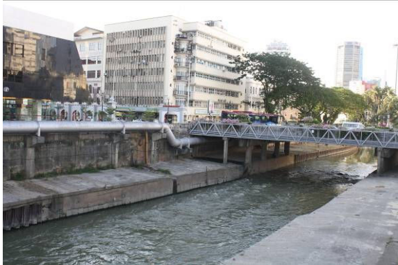
Figure 16: Quality of water at Sungai Klang

The water need to be treated to achieve good water quality and create better sense of smell for the public. Aspect of quality environment is an important element in dealing space for public comfort and health.