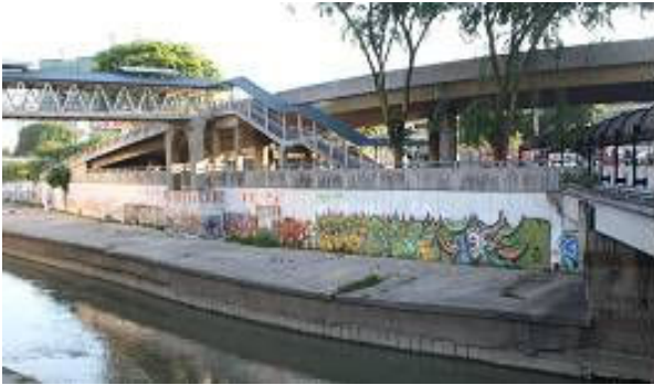
Figure 11 : The wall of river bank where anonymous artists produce their masterpiece.