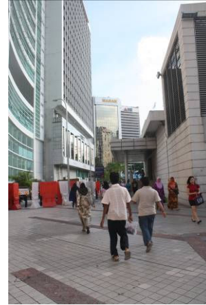
Figure 9: Variety building form and function can be seen as passing through the waterfront.

Variety of experience implies places with varied form, uses and meanings. The area study is placed with varied users and has varied building types and from. People can experience variety of building form with different functions as they pass through the waterfront (See figure 9).