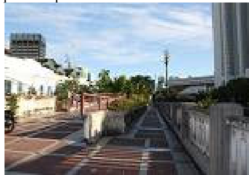
Figure 15: Lacking of vegetation and street furniture at the site.

Street furniture for public amenities is hardly found along the walkway. Benches, signboard and lightings are among the furniture that can create a visual interesting environment. Street lighting is lacking at the site which will reduce the sense of safe and secure to the public during night (See figure 15). These weaknesses should be highlighted by the authorities to create more inspiring and pleasant space for public.