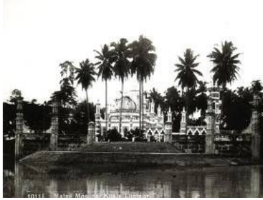
Figure 3: Masjid Jamek, 1910

Masjid Jamek is formerly served as Kuala Lumpur's main mosque. This historic mosque was built in 1909 which is also known as the oldest mosque in the city (See figure 3 & 4). The mosque is situated at the confluence of Sungai Klang and Sungai Gombak, the birthplace of Kuala Lumpur.