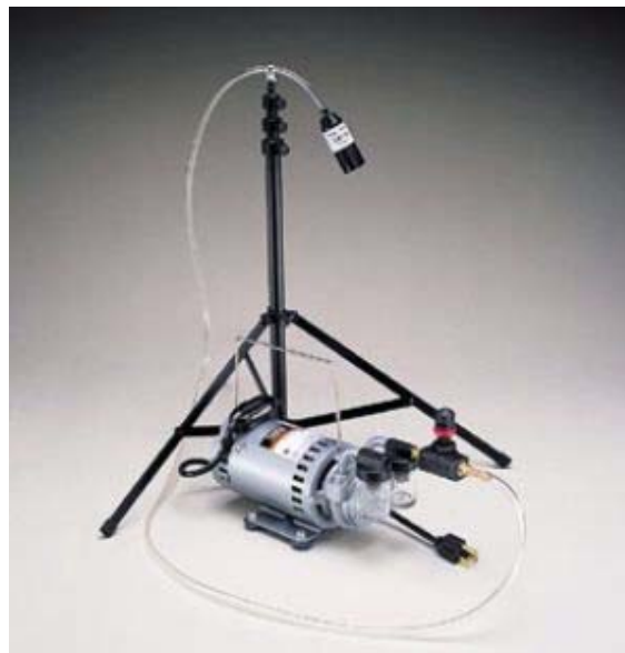
Photo 1. Allegro A100 Pump

For gravimetric analysis was used the following equipment: