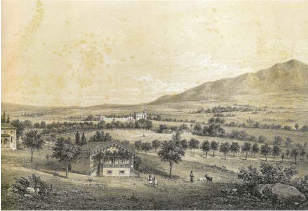
Fig. 4. Eptalofos with the palace Tour la Reine at the background and the houses of the gardeners at the foreground.

natural and one artificial) 1 . Each hill has the name of an Argonaut (Jason, Polydeuces, Kastor, Theseus, Hercules, Orpheus, Pileus).