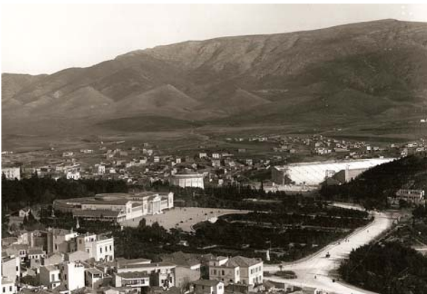
Fig.7. Zappeion Hall and its Gardens

The Zappeion Gardens around the exhibition hall, the second largest park in the city centre, extending from the Stadium at the east to the edge of the old town at the west are fairly large at 11.4 ha i.e two thirds of the surface of the Royal Garden (Fig.7) [17]. They are comprised by 83.000 square meters of planted area, 41.000 square meters of paved surfaces and 240 square meters of atriums and patios.