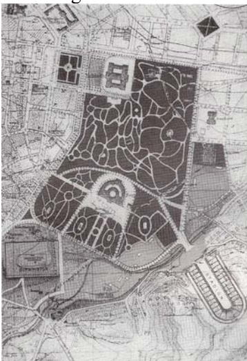
Fig. 2. Ground plan of Royal Garden.

The layout of the present Royal Garden (Fig.2) was developed in 25 years (1837-1862). It has been the creation of a strong personality, Queen Amalia von Oldenburg, who had a strong personal interest in horticulture and arboriculture. Her parent had also a strong tradition in landscape architecture as her Father the Duke of Oldenburg had created the picturesque family gardens at Rastede and Eutin, according to the romantic trends of the time.