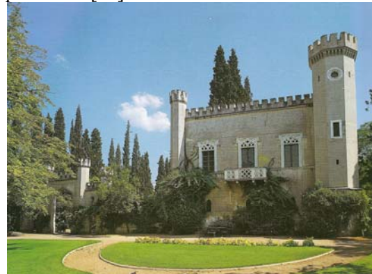
Fig. 5. The palace Tour la Reine.

The property of Eptalofos is consisted of the Swiss style gardeners' houses, which were built at the seven hills of the estate, and the Queen's Tower (Tour la Reine). The Tower, restored by Directorate of Restoration of Modern and Contemporary Monuments, is a unique monument of neogothic architecture in Greece, most likely work of F. Boulanger or Chr. Hansen (Fig.5). According to some researchers the Tour la Reine is a result of the repair of Williams' Mansion. The two storey building with the windows and towers of gothic style was constructed between 1851 and 1854 and it follows the European tradition of the maisons de plaisance [16].