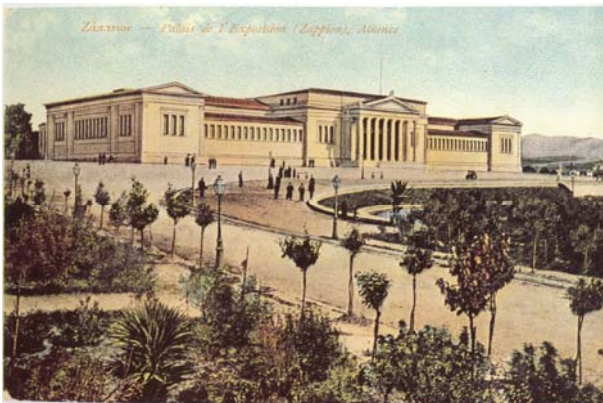
Fig. 6. Zappeion Hall.