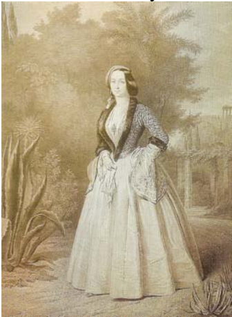
Fig. 1. Queen Amalia, the first queen of Greece.

and in the other hand as a natural environment of the romantic theory.