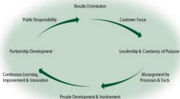
Figure 3: Business Excellence Model [12].

The inclusion of enterprises in the international market, the care for reputation, that the enterprise profit with the environment protection and permanent development, places the politics of environment protection and business excellence to the base of the professional politics [7]. The current position of an organization with regard to the environment can be established by means of an initial processes operations and quality policy[3]. This is why the integration of environmental goals into the system of entrepreneurial policy is so vital. In theory, we can distinguish the ones, which pertain to the inflow (rational use of raw materials, materials, energy, etc.), and those, that relate to the outflow (absolute limitation of waste and emissions), with the simultaneous maximisation of waste re-use [8]. All the activities of Dravske Elektrarne Maribor comply with quality management standards according to the ISO 9001:2000, ISO