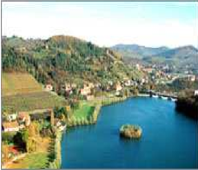
Figure 4: Maribor Lake [12].

Our care for sustainable development safeguards the quality of life for current and future generations. For it is only right that we are close to nature, which allows the existence of both ourselves and the people with whom we live together. We want to responsibly and creatively co-shape the environment in which we operate, and thus our attention is directed towards numerous projects in all areas of Dravske elektrarne Maribor's activities, from Dravograd to Formin. Within the scope of economic possibilities, we support a number of humanitarian, sports, cultural, educational and other projects, as well as socially advantageous activities on the local, regional and national level [12].