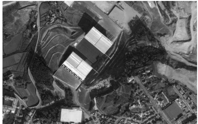
Figure 2- Aerial view of the Braga Stadium – Before and after the reclamation.

This visual conflict between the geometric and formal expressiveness of the stadium and the natural, shapeless walls which surround it, finally find a point of synthesis in the pressured roof, in which the cables (symbolizing the bridges that were constructed by the Inca civilization) deformed by the weight are able to camouflage the repetitive sequence in the changing texture of its natural environment.