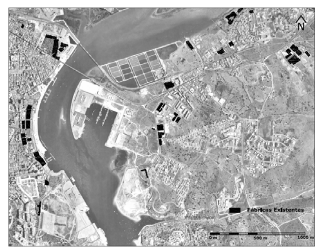
Figure 3- Aerial view of the Arade valley old industrial landscape.

The circumstance of the First World War had a great importance for the development of this industry, once it absorbed all the production. At this time almost two thirds of the population worked on industry [25]. Even so, during the sixties the industrial activity collapsed and numerous industrial structures left abandoned. However, the memory of the place remained as fragments of collective history of an activity that shaped lives along time. A memory that if will not be protected faces the risk of disappearing forever.