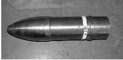
Fig.1. The projectile used in the experiments

By means of the method, the calculation and comparison with the experiments are made on the deceleration of penetration characteristics of ogive-nose projectile normally penetrating into thick concrete target. We conducted the deceleration experiments of penetration with the ogive-nose, steel projectile as shown in Fig.1