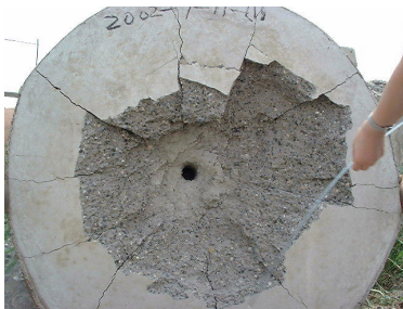
Fig.2. The penetrated target

The penetrated concrete target in tests is shown in Fig.2.