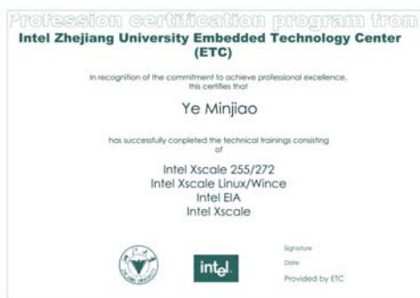
Figure 4: An example of the Intel Training Certification.