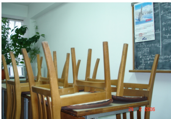
Figure 2. The electronic course

The electronic course, will follow the electronic book contents, the chapters becoming modules. It is not designed for the international scientific community, like the book, but for the people having high economical / technical / mathematical education or well prepared students wanting to rapidly assimilate [9] this area of knowledge. Because of this fact, the presentation will be made different: the explanations will give careful attention to details, much more examples will be gradually presented, connections with the assumed known basics will be presented, the approaching means of the novelities will exist, the interactivity technique will be used with predilection, most frequently formulated questions will appear at the end of each module, the questions for knowledge verification will be in large number and the design will be different. The course graduation exam and the proving certificate granting will also be made by electronic means. The MADM electronic course graduation will be on 3 levels (beginner, professional, expert). The random selection algorithm from tests base, models and problems base, with collisions minimization, the up-loading mechanism of the students proposed problems and the up-loading mechanism of the theoretical considerations concerning MADM domain made by the students will be another strong points of the electronic course.