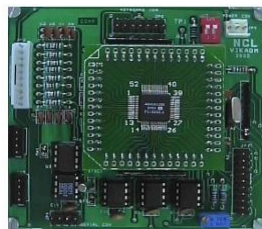
Figure 1: Lilliputian Platform with ADuC 842

A facility of writing data in to a excel / text file format is provided on PC. The Microconverter module consists of AT24C64 for I 2 C memory, DS1307 for I 2 C RTC, MAX813 for power supervisory circuit, MAX 232 as UART port driver and interface for graphic LCD. (Please refer to Fig. 1). Xaimen GDM12864A graphic LCD is used which is 128 X 64 pixel and having 0.48 x 0.48mm pixel size with backlight facility. System is secured and protected through password.